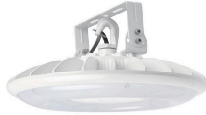
140W & 180W