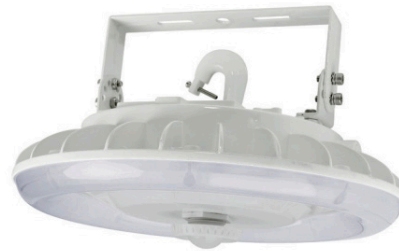
67W & 97W